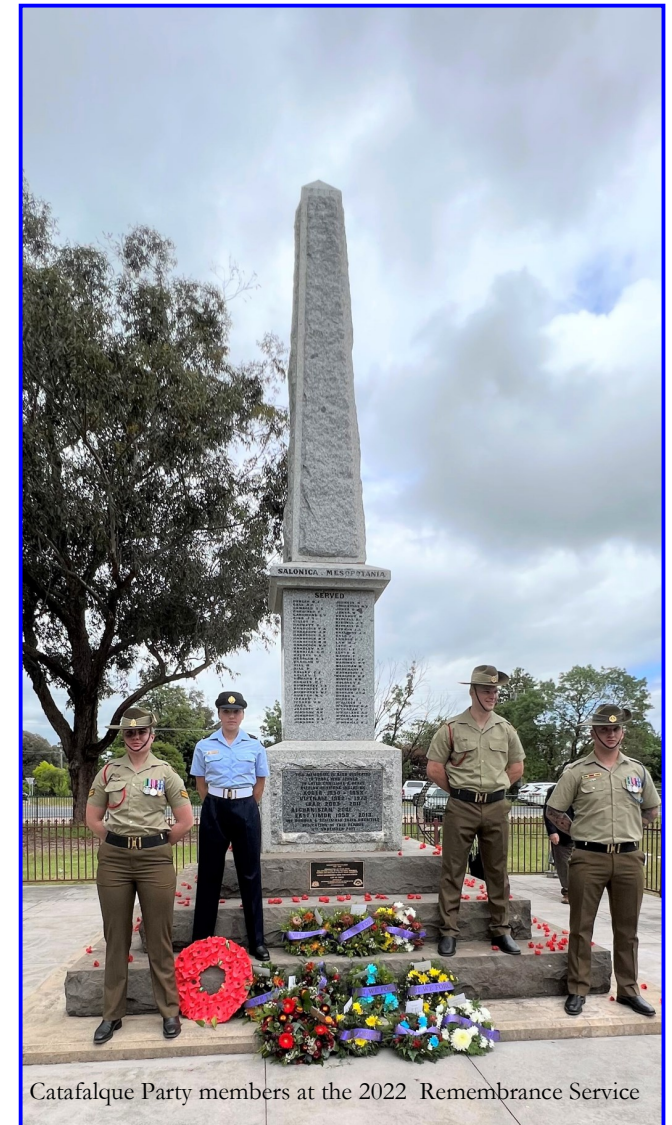
Catalaue Party members at the 2022 Remembrance Service