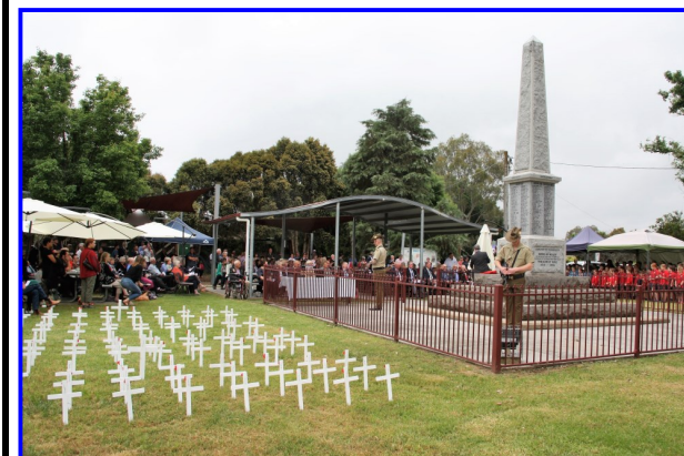
The 2022 Remembrance Day service where we commemorated the Centenary of the Oxley Shire Memorial

Poppies Provided: by the RSL Wangaratta.